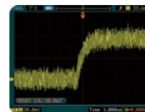
Adjustable Trigger Sensitivity The ability to filter noise from the signal avoids false triggers