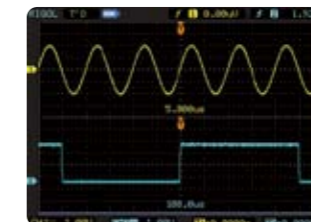
Alternate Trigger Provides a true dual timebase display