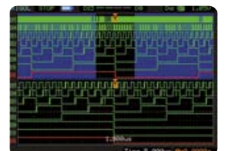
Duration Trigger A combination of Pattern Trigger and Pulse Width Trigger capabilities make isolation of events easy