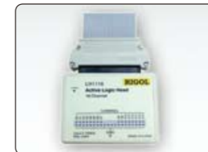
Logic Analyzer Module

Mixed Signal Oscilloscope (MSO) with 16 channels Logic Analyzer (LA). LA is divided into two groups: D7-D0, D15-D8. Each works separately.